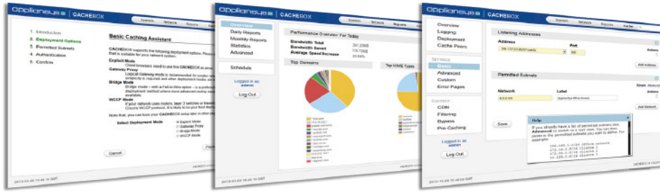
Configuration wizards, graphical reporting and online help

“We needed to bring content to the classroom faster so kids could do more in the classroom. CACHEBOX proved itself overnight. 32% average bandwidth savings across the day, with savings of up to 90% at busy spots during the day. I've noticed a big improvement in speed.”